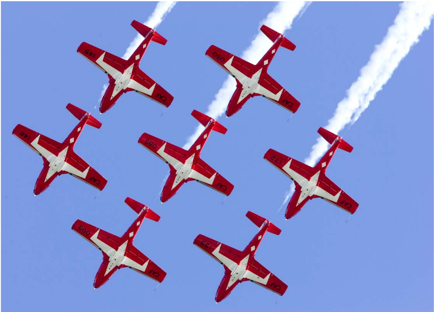
Canadian Snowbirds aerobatic team performed over Nanaimo Harbour on Wednesday.