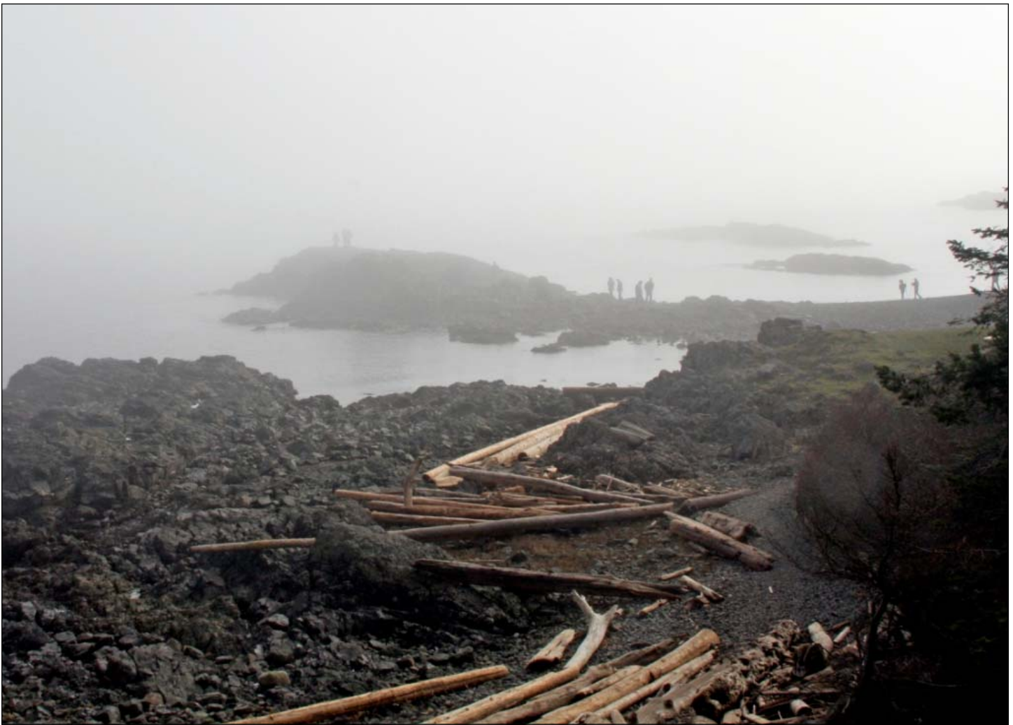
Even the fog rolling in on Sunday of this week couldn't deter the many people who like to walk in Neck Point.