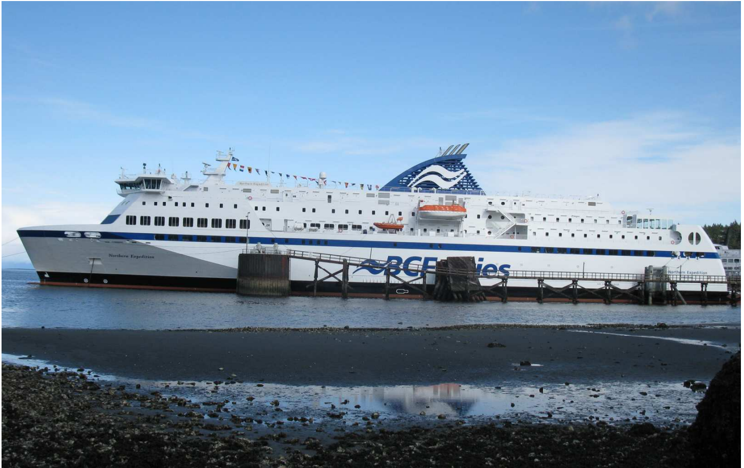
Northern Expedition stops in Nanaimo on its way to the northern BC