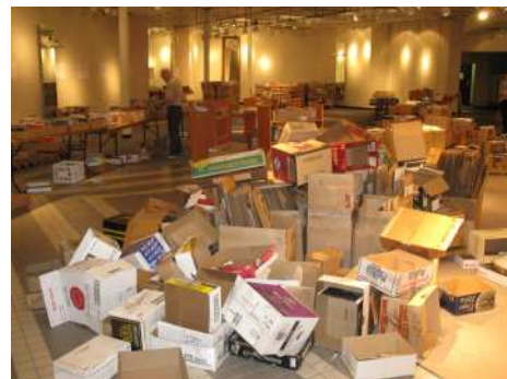
Book sale in 2 weeks - please come for one or two of the work parties left.