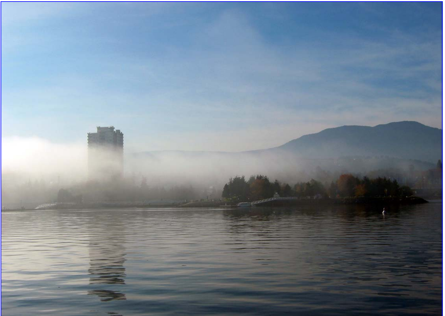
Fog lifting from Nanaimo Harbour, a predictable Autumn event.

Club Meeting Friday at 12:15 p.m. at the Coast Bastion Inn