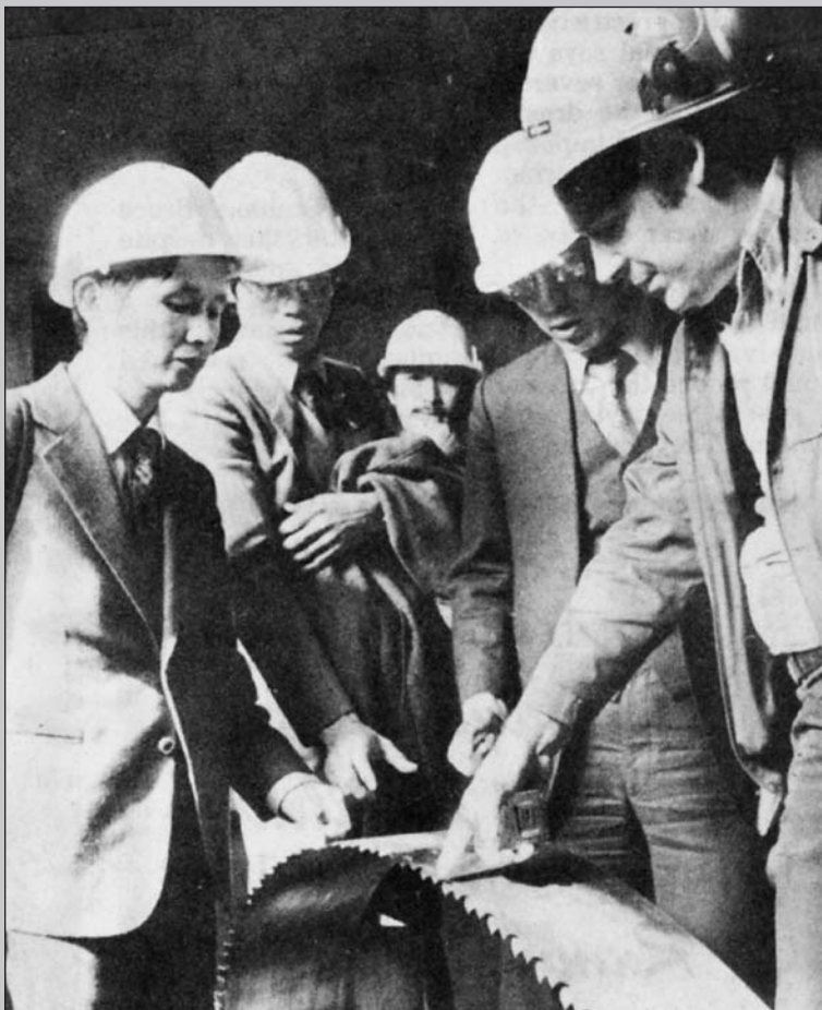
Group of Taiwanese businessmen sponsored by Rotary, visiting Pacific Forest Products Mill, Ladysmith, April 1981.